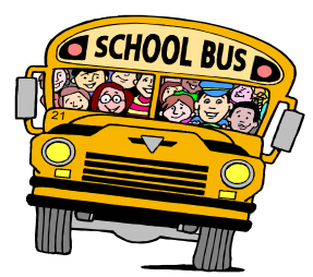
The Freshly Renovated Griswold Middle School Welcomed Students in January

expected to welcome students by the summer 2012. Take a moment to drive by the school campus to see for yourself the beautiful commitment that we are building for our children. Thanks to our School Building Committee & our amazing teachers & staff for their hard work and dedication throughout this endeavor!